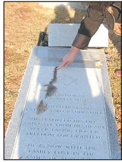
Nearly 500 graves were toppled by vandals in New Brunswick.

Announcing the arrest of four juveniles in a devastating attack on a New Brunswick Jewish cemetery, investigators said the evidence points to an act of vandalism rather than a bias crime.