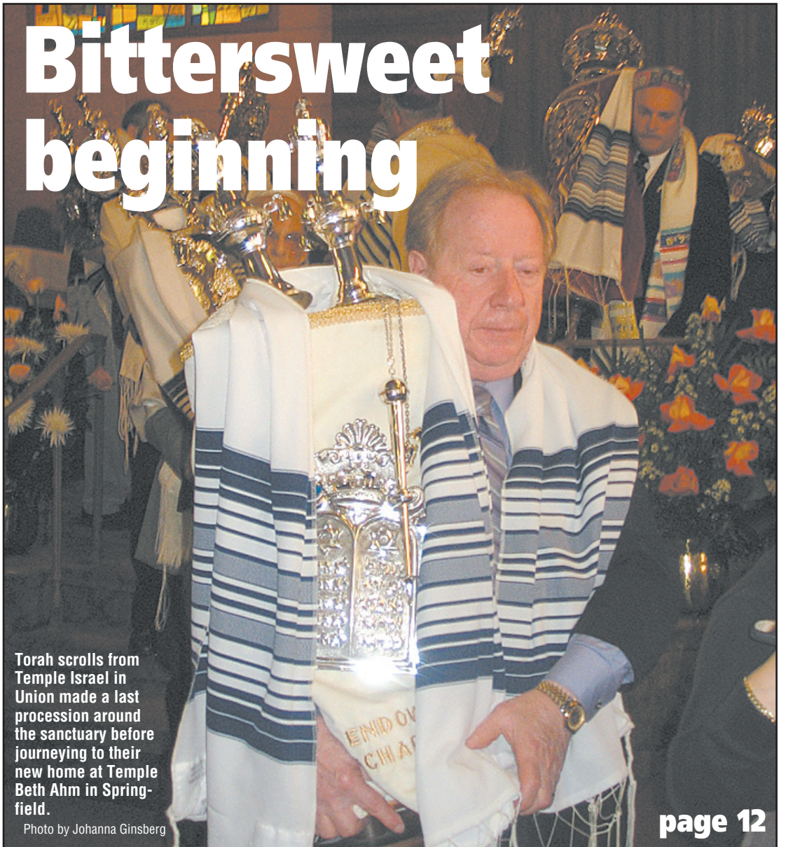
Torah scrolls from Temple Israel in Union made a last procession around the sanctuary before journeying to their new home at Temple Beth Ahm in Springfield.