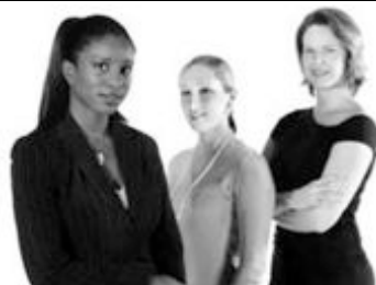
Because it's good to know you're not alone